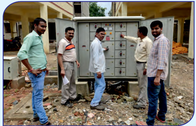
Inspection of A-Type quarters at Chikla Mine.