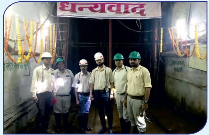
Underground Inspection at Munsar Mine.