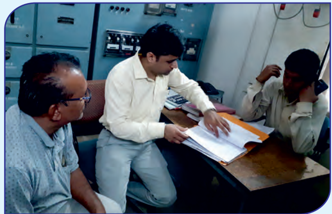
Inspection at FMP, Balaghat Mine